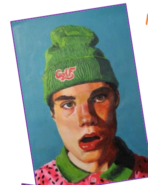
Mixed Media techniques