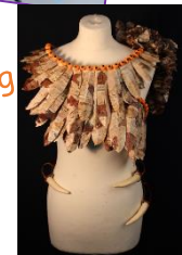
Jewellery Making Techniques