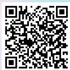
RCS Production Technology & Management