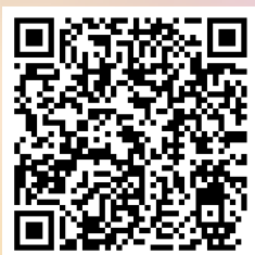
QMU Theatre & Film